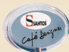
Removable sticker holder